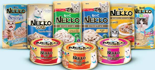
NO. 1 BEST-SELLING WET CAT FOOD IN THAILAND