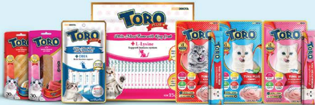
CAT TREATS FOR THE GREAT MOMENTS