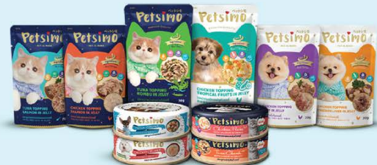
WELL SELECTED INGREDIENTS FOR PETS