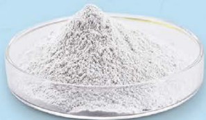
VITAMINS & MINERALS