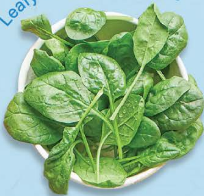
Leafy Green Vegetables