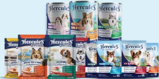
HIGH PERFORMANCE DOG FOOD